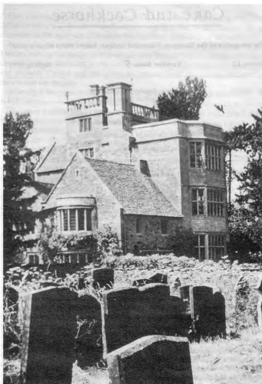
Castle House, Deddington.